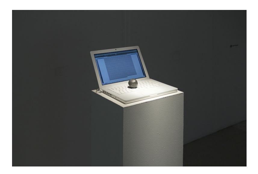
'g' (2008), by Jack Strange. A "g" key of a laptop is held down by a lead ball, repeating the letter into a Microsoft Word document.

(http://thingsfittingperfectlyintothings.tumblr.com) or "The Jogging" (http://thejogging.tumblr.com), with its particular brand of Duchampian manoeuvring. Jack Strange's 2008 exhibition work 'g'—an exhibition piece where a lead ball is placed on the 'g' key of a Macbook laptop—places technological dullness on a pedestal. Gone is the art-and-technology of "New Media Artist," aiming at some terrifically preposterous future of art, or of the media. Technical media is composed of embarrassingly simple and commonplace, repeated elements (the micro-switching of a WiFi router, the ordinary hand-to-mouse gestures of a film editor, etc.). The exciting exhilaration of "Where do you want to go today!?" digitality is set against its monstrous monotony: The repetition of keystrokes, clicks, logic gates, ethernet routers and seemingly neverending lists. ("Where do you want to go today?" was Microsoft Corporation's global campaign slogan for most of the mid-90s.)