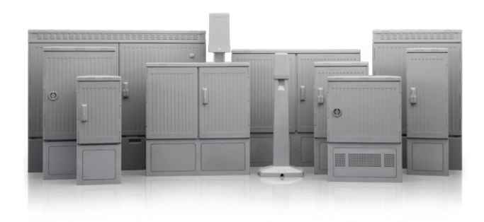
The Sichert family of cross connection and KVz-

There are significant impediments to understanding large and complex technologies, and one mode of invisibility is here brought about through a purposeful projection of tedium. For example, "one of bureaucracies' most effective, least appreciated weapons is its tedious technical reports. Like frigid February elections in Chicago, these fat volumes dissuade all but the most faithful." (Espeland 109) There is a particular colour of grey used in the telecommunications industry that, at least in industry folklore, has been psychologically proven to be the world's most boring colour. This cognitive camouflage marks everything technological that is intended to be uniformly dull and uninteresting. The seemingly colorless cross-connection boxes that stand aloft in the urban landscape are like tombstones of a bygone digital era, an invasive species we aren't supposed to notice the presence of. Fuller and Goffey define "grey media" as those, "databases, group-work software, projectplanning methods, media forms, and technologies that are operative far from the more visible churn of messages about consumers, empowerment, or the questionable wisdom of the information economy." (Fuller 9)